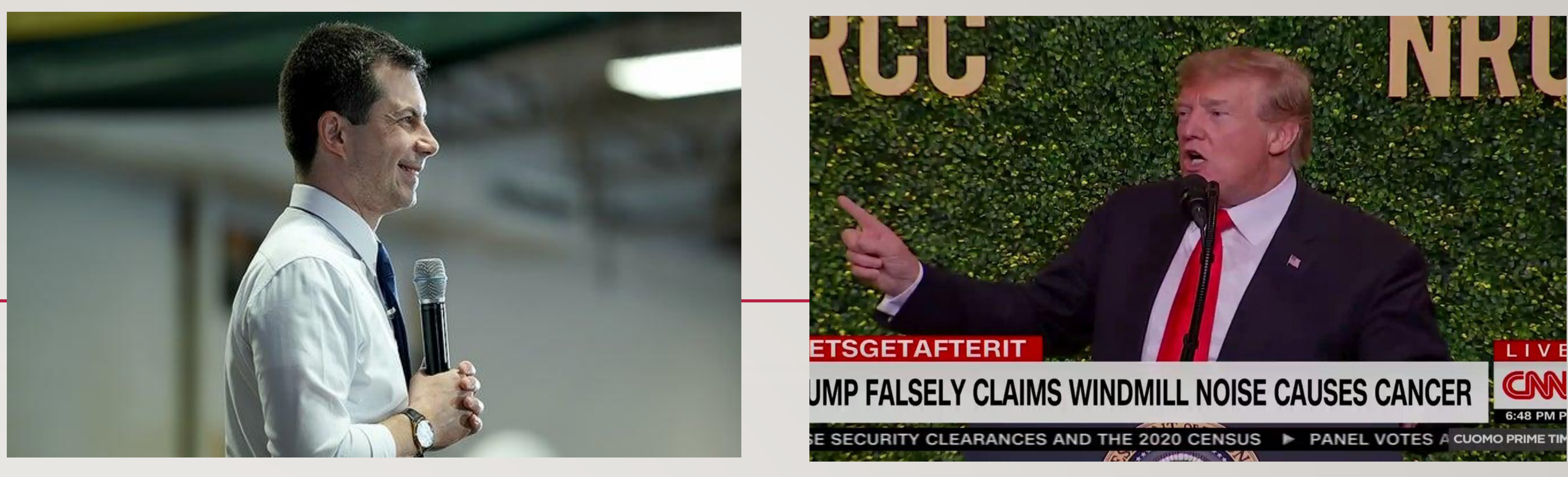
Pete Buttigieg after declaring victory in the Iowa caucus 2020 despite results being delayed for two days: https://thehill.com/homenews/campaign/481502-buttigieg-againclaims-victory-after-partial-iowa-results-show-him-leading

https://www.cnn.com/videos/media/2018/12/16/2018-a-yearconsumed-by-misinformation-rs.cnn