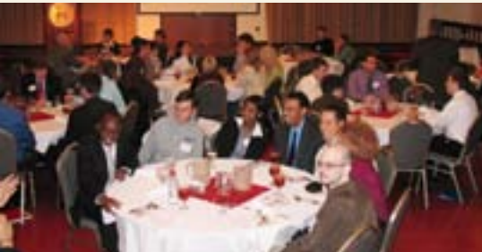
Participants enjoy the luncheon and guest speaker during the conference

The 18th Annual Illinois State University Conference for Students of Political Science was held at the Bone Student Center on Friday, April 23, 2010. The event, organized