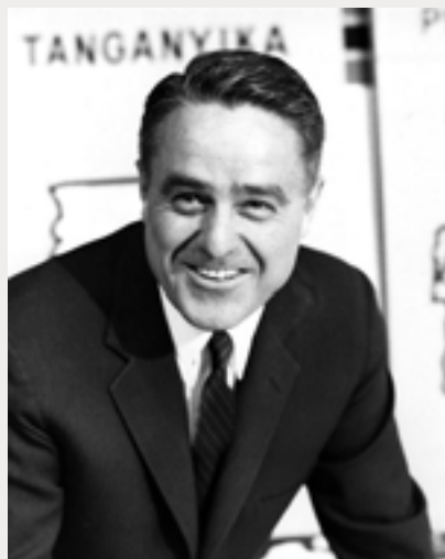
R. Sargent Shriver

The Peace Corps gave me the most memorable, continuing, morally unblemished, and uncompromised chance ever given any American to serve his country, his countrymen, and his fellow human beings worldwide, simultaneously, and at the grassroots level with the poor everywhere.”