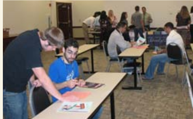
Students talk to law school representatives at the 2010 Illinois State Pre-law Student Conference.