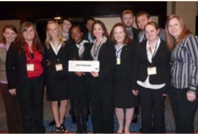
Model United Nations students represented Botswana at this year's National Model United Nations.