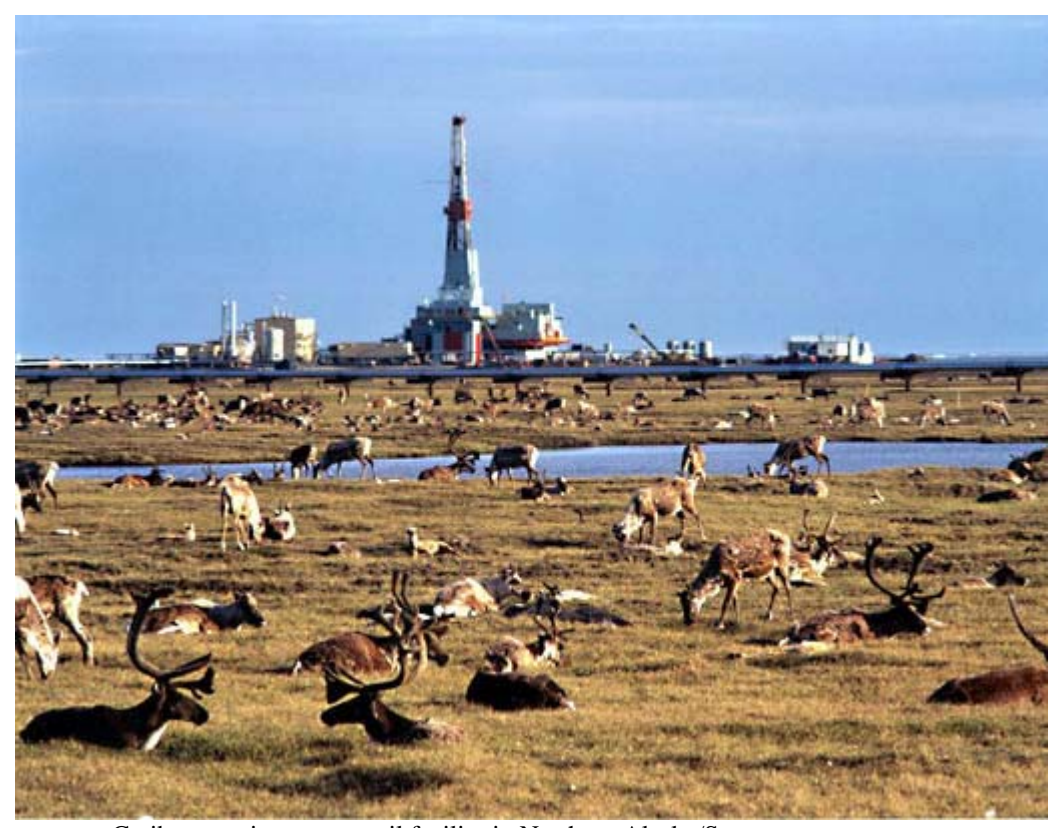
Caribou grazing near an oil facility in Northern Alaska