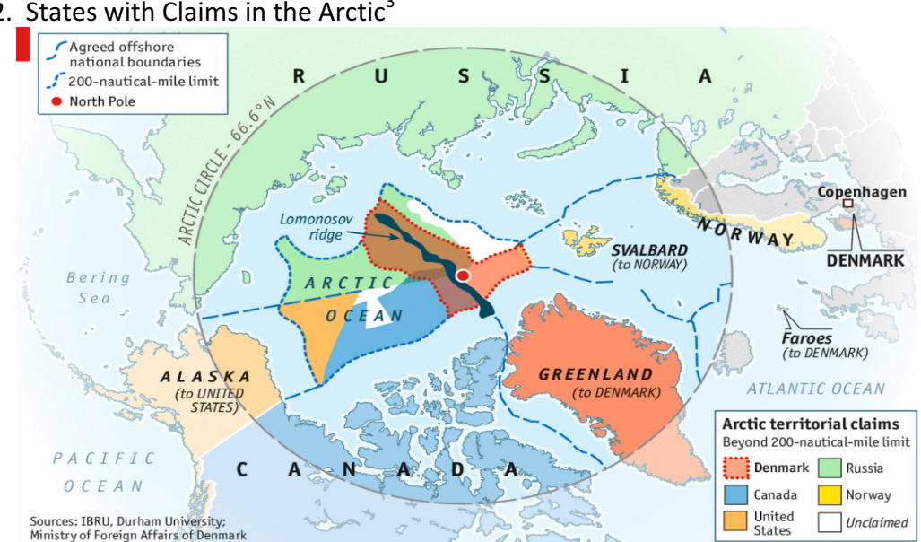
Figure 2. States with Claims in the Arctic<sup>3</sup>

states. Figure 2 illustrates the territorial borders in and around the Arctic ice cap which is necessary in determining land claims and sea routes in the region as defined by the UN Convention on the Law of the Sea (UNCLOS).<sup>2</sup>