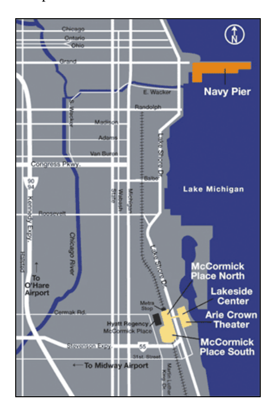
FIGURE 1: Navy Pier Area Map

engaging the region and nation as visitors to the country's third-largest city. Byrne's desire would materialize, but not in her tenure as mayor. At the time of Byrne's visit to Boston, Navy Pier was